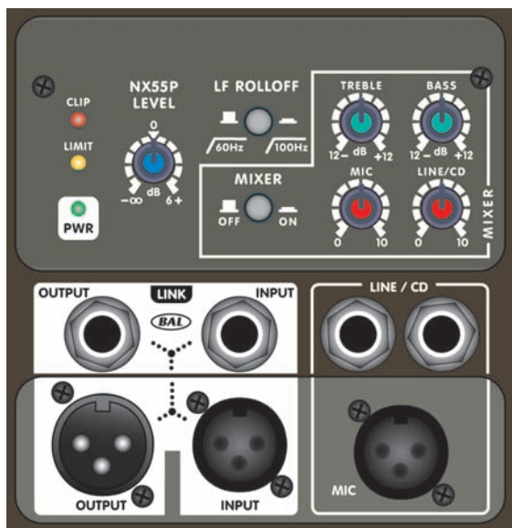
NX55P Rear Panel